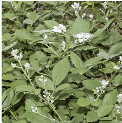
Flowering branches. Nadgee Nature Reserve south of Eden.