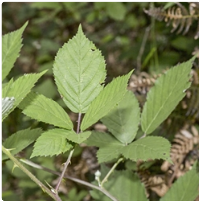
Leaves on stems. Nadgee Nature Reserve south of Eden.