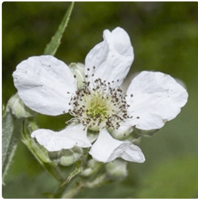
Flower. Nadgee Nature Reserve south of Eden.