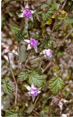
Flowering stems. Photographer Don Wood, near Brogo