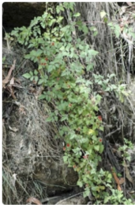
Shrub trailing on rock face. Kosciuszko National Park