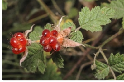
Fruit and leaves. Australian Plant Image Index, photographer Murray Fagg, Kosciuszko National Park