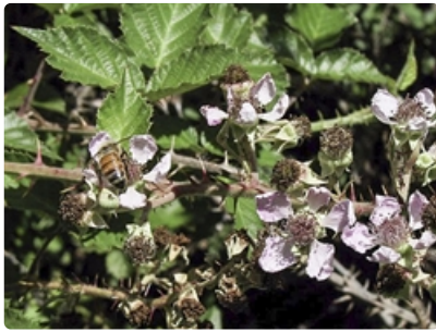
Flowering branch and leaves.