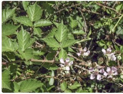
Flowering branch and leaves. Photographer Jackie Mles, Jindabyne