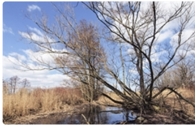
Winter tree.