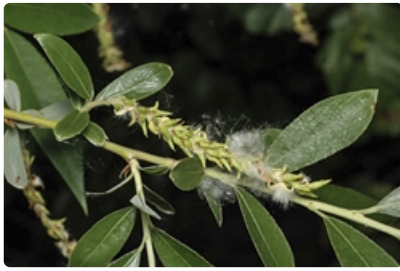
Leafy stem with female catkins with developing seeds (var. vitellina ). Lake Burley Griffin, Canberra, ACT