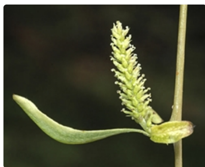
Female catkin. Black Mountain Peninsula, Canberra, ACT