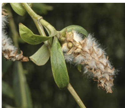
Seedling female catkin. Lake George south of Goulburn