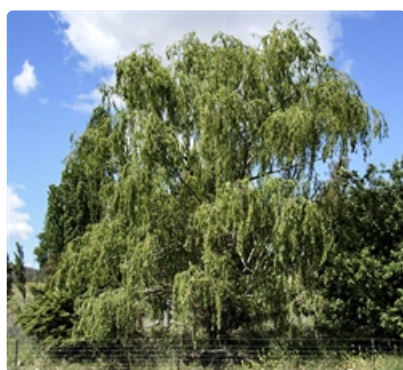
Tree in summer colours. Lake George south of Goulburn