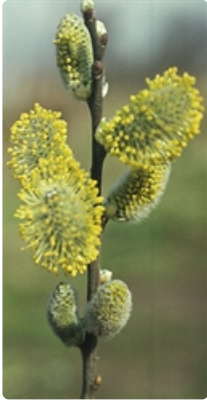
Male catkins. Photographer Frances Schmechel, New Zealand