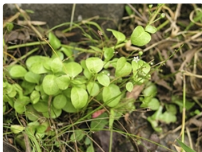
Flowering plant.