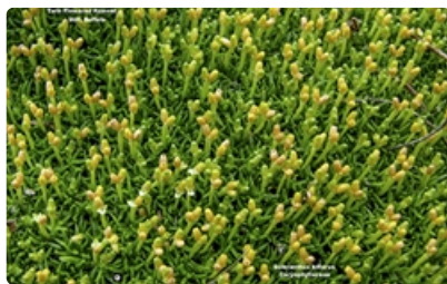
Flowering plant. Mt Buffalo, Vic