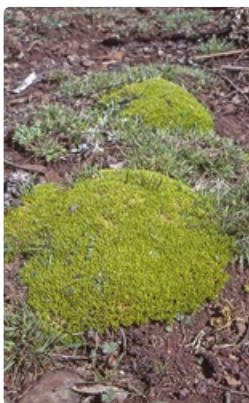
Cushions. Photographer Don Wood, SE Forests National Park