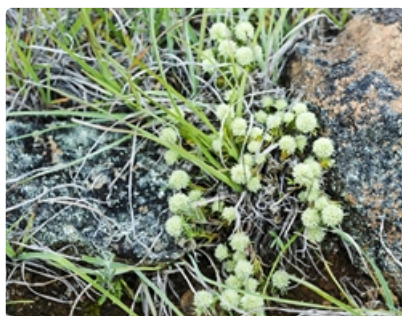
Flowering stems. Scottsdale Bush Heritage Reserve near Bredbo