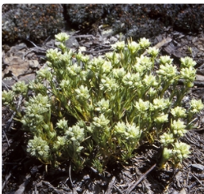
Flowering plant. Mulligans Flat Nature Reserve, ACT