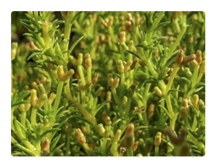
Flow ering carpet.