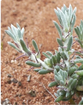
Burrs and leaves. Photographer Don Wood, Scotia Sanctuary, western NSW