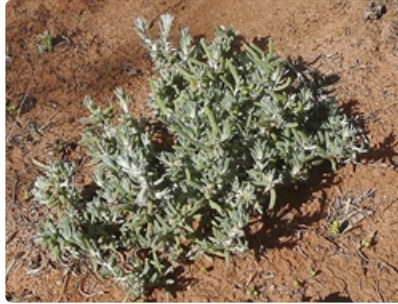
Plant. Scotia Sanctuary, western NSW