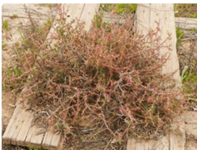
Shrub (var. muricata ). Scotia Sanctuary, western NSW