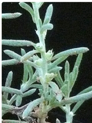
Young burrs and leaves (var. semiglabra ). Photographer Don Wood, Scotia Sanctuary, western NSW