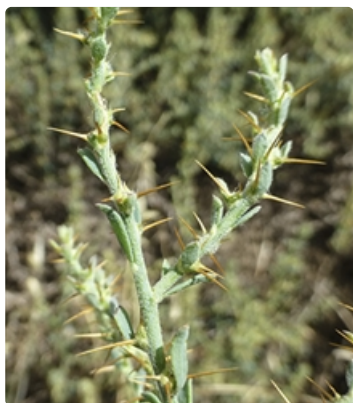
Leafy stems with burrs. Beard, ACT.jpg