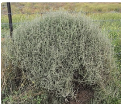
Shrub (var. villosa ). near Melbourne, Vic