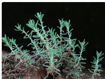
Plant (var. semiglabra ). Scotia Sanctuary, western NSW