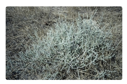
Shrub. Conargo to Hay