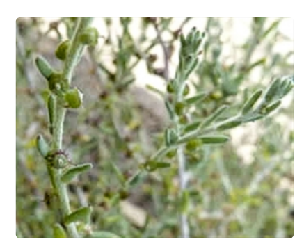
Burrs and leaves. Unknown photographer, Trust for Nature, Ned's Corner Station Reserve via Lake Culluleraine, Vic