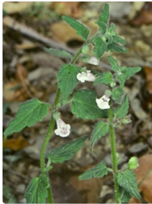
Flowering stems. Nullica State Forest south of Eden