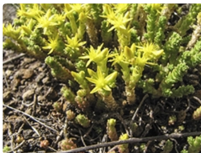
Flowering plants.