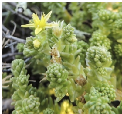
Flowering plant. Paddy's River, ACT