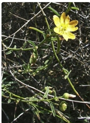
Flower and leaves. Photographer Greg Steenbeeke, Bellata, NSW