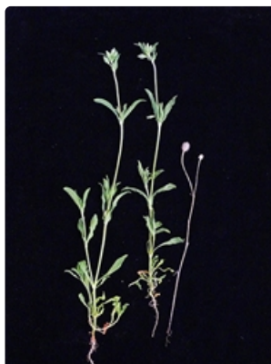
Plants. Scotia Sanctuary, western NSW