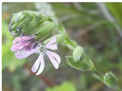
Flowering stem.