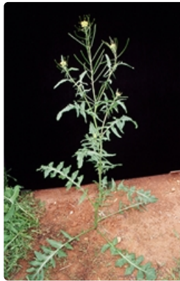
Flowering plant. Photographer Don Wood, Scotia Sanctuary, western NSW