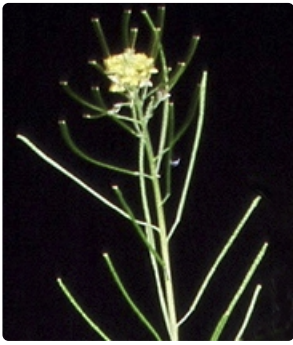
Flowering and seeding stem. Scotia Sanctuary, western NSW