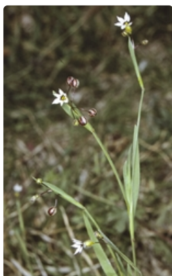
Flowering plant. north of Bega