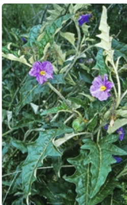
Flowering stems. Mt Tennent, Namadgi National Park, ACT