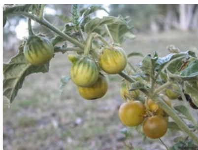
Ripe fruit and leaves.