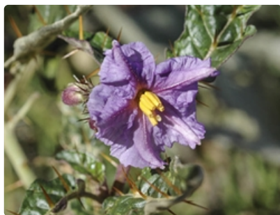
Flower. Stony Creek Nature Reserve, ACT