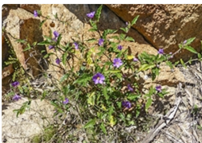
Flowering shrub. Photographer FranM, Canberra, ACT.