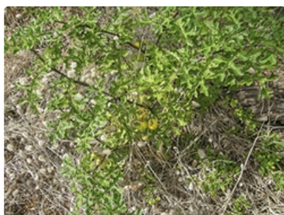
Fructing branches. near Portland, Vic