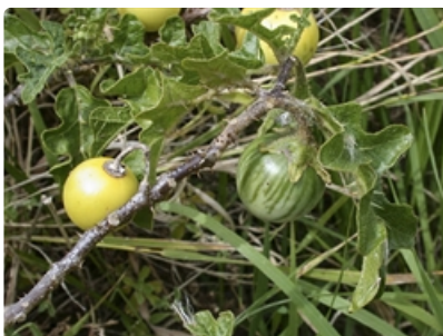
Fruit. Clifton Springs foreshore, Vic