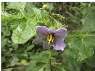
Flower and leaves. Australian Plant Image Index, photographer RCH Shepherd, Sorrento, Vic?