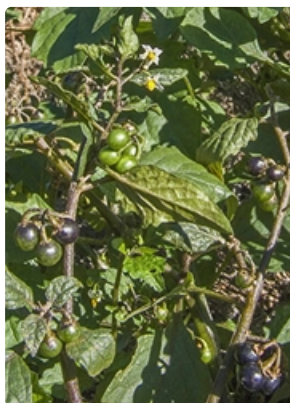
Flowers, fruit, and leaves. Scotia Sanctuary, western NSW