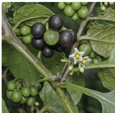
Flowers, fruit, and leaves. Boorowa-Cookwell Road