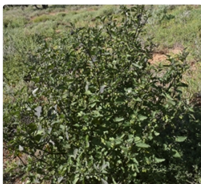
Plant. Scotia Sanctuary, western NSW