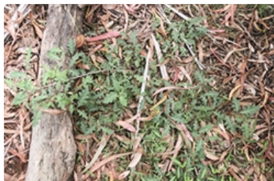
Plant. Brogo, north of Bega