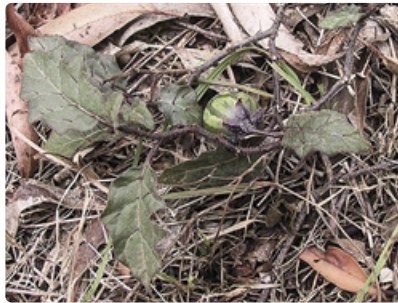
Fruit and leaves.