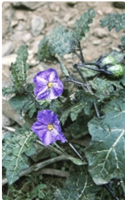
Flowering branches with green fruit. west of Cobargo