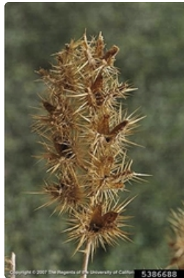
Open seed cases.