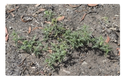
Rant. Black Mountain, Canberra, ACT