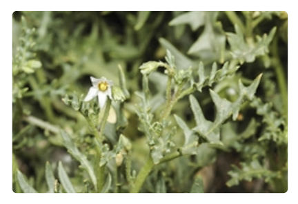
Rower and leaves. Jerrabomberra Wetlands, Canberra, ACT