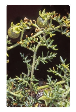
Leafy stems and fruit. Photographer Don Wood, Grassy Creek crossing, Namadgi National Park