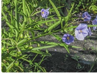
Flowering branch with green fruit.