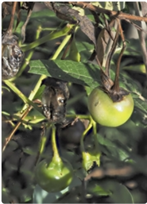
Fruit and leaf. Namadgi National Park, ACT