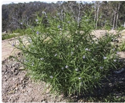
Flowering shrub.