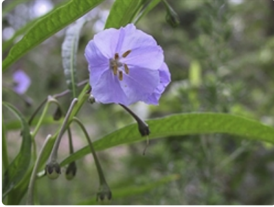
Flower and leaves.