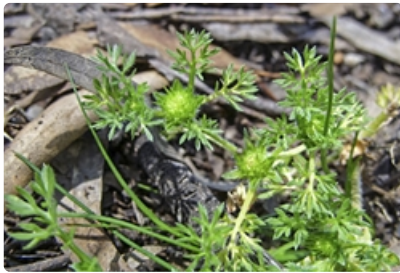
Flowering plant. Illunie Nature Reserve south of Cowra