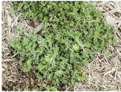
Flowering plants. Scottsdale Bush Heritage Reserve near Bredbo