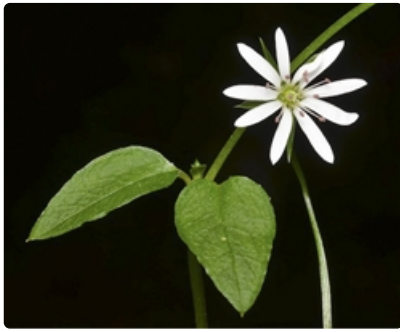
Flower and leaves. Australian Plant Image Index, photographer Murray Fagg, Australian National Botanic Gardens nursery, Canberra, ACT