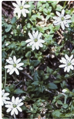
Plants. Brogo Bush Heritage Reserve, Brogo