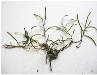
Plant.