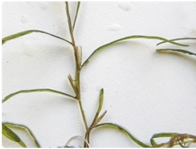
Closeup. unknown place