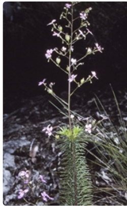
Flowering plant. Bomaderry Creek Regional Reserve near Nowra