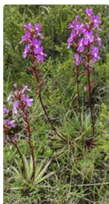
Flowering plants. Photographer Russell Best, Bogong High Plains, Vic