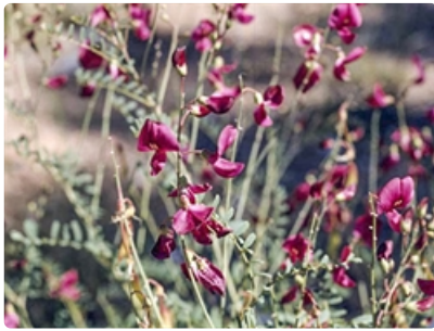
Flowering stems. near Coonabarabran