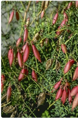
Pods and leaves.