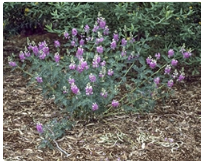
Plant. Australian Plant Image Index, photographer Murray Fagg, Australian National Botanic Gardens, Canberra