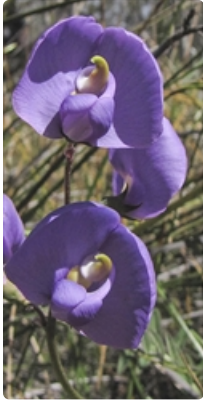
Flowers. Little Desert, Vic