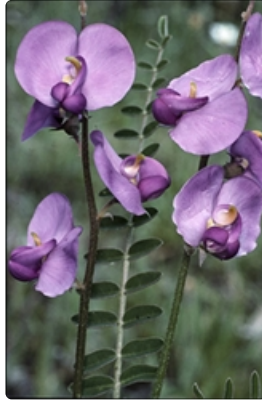
Flower cluster and leaf.