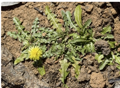
Flowering plants.