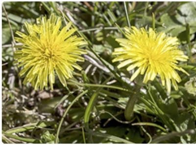
Flower heads.