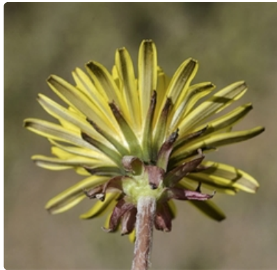
Back of flowerhead showing bracts.