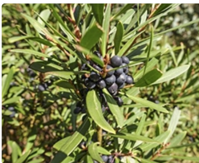
Ripe fruit and leaves. Mt Buffalo, Vic