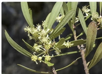
Male flowers and leaves. Kosciuszko National Park