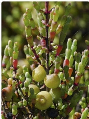
Fructing stems.