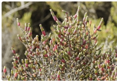
Plant. Mornington Peninsula, Vic