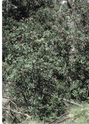
Shrub. Errinundra Plateau, Vic