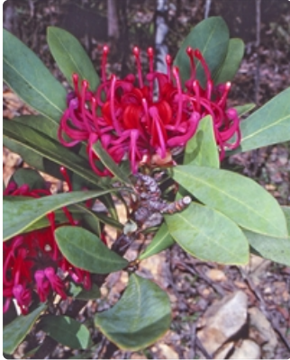
Flowering stem. Photographer Don Wood, South East forests National Park