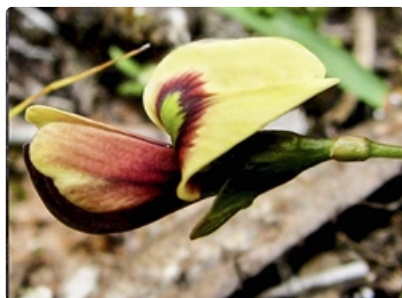
Flower.