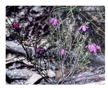
Shrub. unknown place, NSW