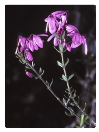
Flowering stems. Brindabella National Park just west of the ACT, NSW