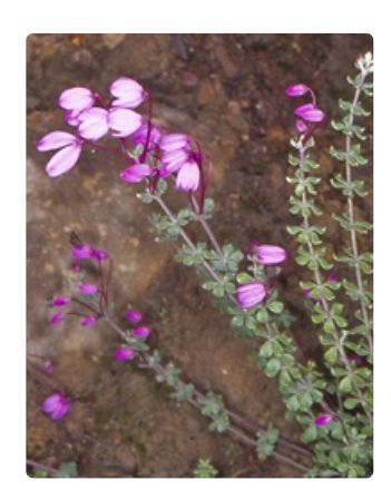
Flow ering stems. Bombala State Forest near Bombala