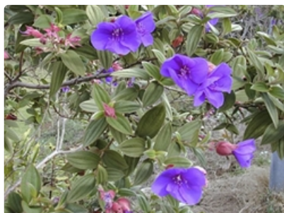
Flowering branches.