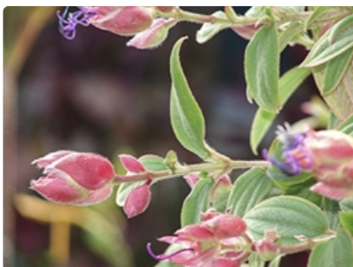
Flower buds with pink bracts.