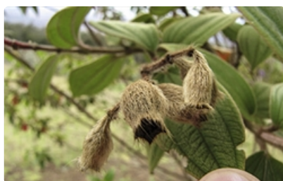
Seed cases and leaves.