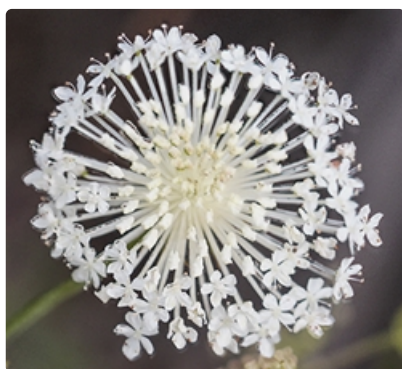
Umbel (var. composita). near Frankston, Vic