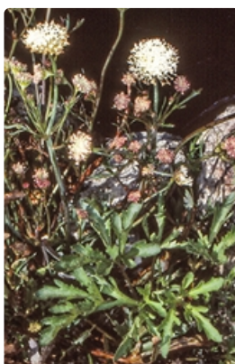
Flowering plant (var. composita ). Namadgi National Park, ACT