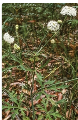
Flowering plant (var. composita ). Photographer Don Wood, Pambula Beach