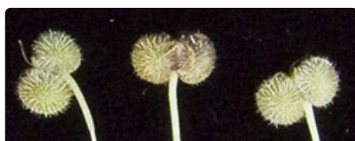
'Seeds' (var. robertsonii). Ben Boyd National Park, north of Eden