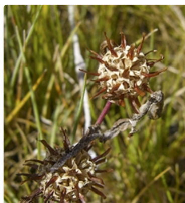
Seeding heads. Photographer Zoya Akulova, California, USA