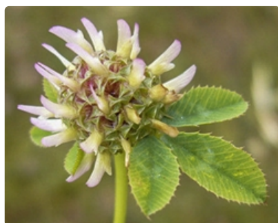
Flower. Photographer Zoya Akulova, California, USA