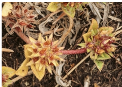
Seed cases.