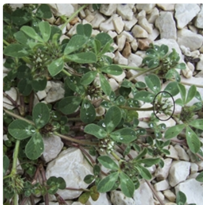
Leafy stems with flowers and immature seed cases.