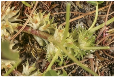
Spent flowers.