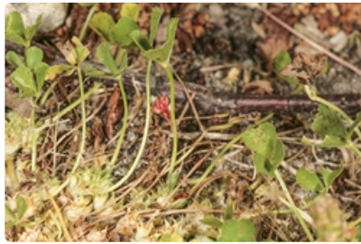
Spent flowers and leaves.