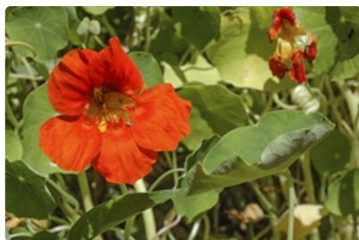
Flower and leaves. Australian Plant Image Index, photographer Murray Fagg, near Bulli.