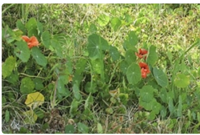
Flowering plant. Photographer Jackie Miles, Broulee