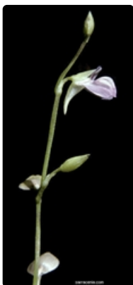
Flowering stem.