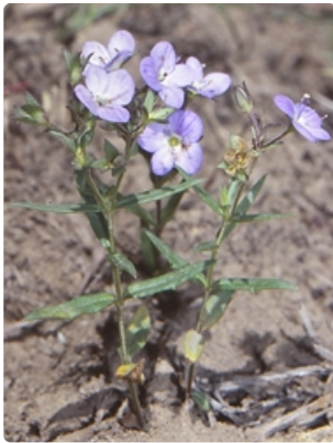
Flowering plants. Morton National Park