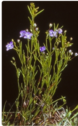
Flowering plants. Smokers Gap, Namadgi National Park, ACT