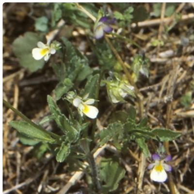
Flowering plant. Mt Franklin Road, Namadgi National Park, ACT