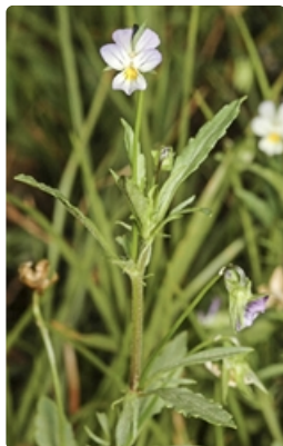
Flowering stems. Kosciuszko National Park