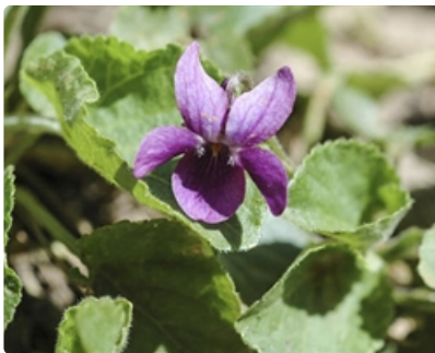
Flower and leaves. Cotter River, ACT