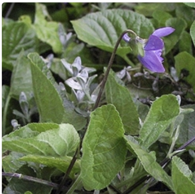
Flower and leaves.