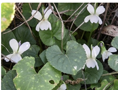
Flowers and leaves.