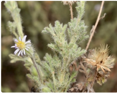
Flower head and leafy stem (var. hirta ). Australian Plant Image Index, photographer Murray Fagg, near Hattah, Vic