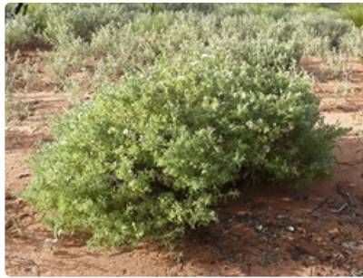
Shrub (var. hirta ). Photographer Don Wood, Scotia Sanctuary, western NSW